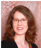
BY ROSE PHILLIPS